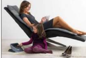
FDA REGISTERED MEDICAL DEVICE